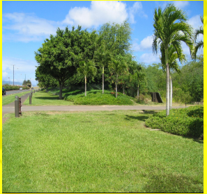
US AIR FORCE - HICKAM AFB, HI