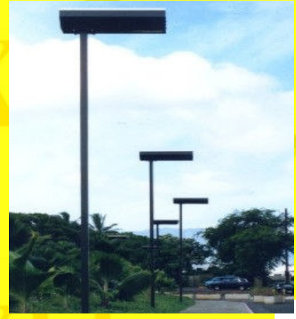
NPS- USS Arizona Memorial, Pear