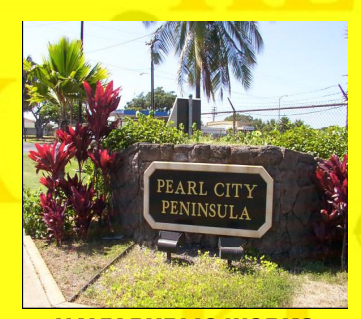
NAVY PUBLIC WORKS CENTER, PEARL HARBOR,

SOL INC.'s products have survived hurricanes because of their patented designs by the engineering staff and the use of premium quality custom-made components. Their products satisfy U.S. Department of Energy design formulas, have been tested by government agencies, have been purchased by all U.S. Military agencies and are approved for safety. SOL INC. customers have enjoyed millions of hours of trouble-free service.