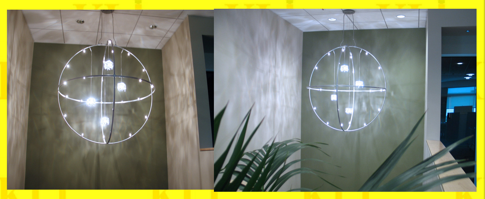
If you can think it... We can do it! Is Bruck's motto. And you thought track lighting was just for lighting up pictures.