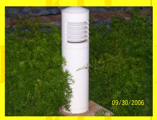
One of our most recent projects was lighting up the exterior of the Honolulu Fire Department's new headquarters. BEGA fixtures were used for the entrance and front steps, Elliptipar was used for uplighting of the exterior walls and B-K bollards for the path lighting.